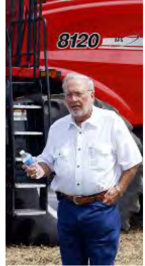
Sen. Joey Pendleton, of Hopkinsville, addresses a crowd at an Interim Agriculture Committee meeting last September.