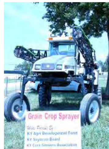
A grain crop sprayer, supported by the KADF, on display at the UK All Commodity Field Day at the UK Research and Education Farm in Princeton.

Jessamine County FFA Alumni Association $8,000 in Jessamine County funds