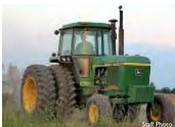
CDL to drive a tractor? Implements of husbandry as commercial vehicles was an issue addressed by FMCA's guidance.

Following a 60-day comment period asking farmers, farm organizations and the public to provide input on longstanding safety rules, the U.S. Department of Transportation