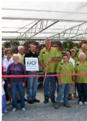
KADF sign presentation and ribbon cutting at the grand opening of Owens Greenhouse and Garden Center in Pulaski County.